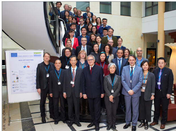
Kick-off Meeting in Dresden in January 2018